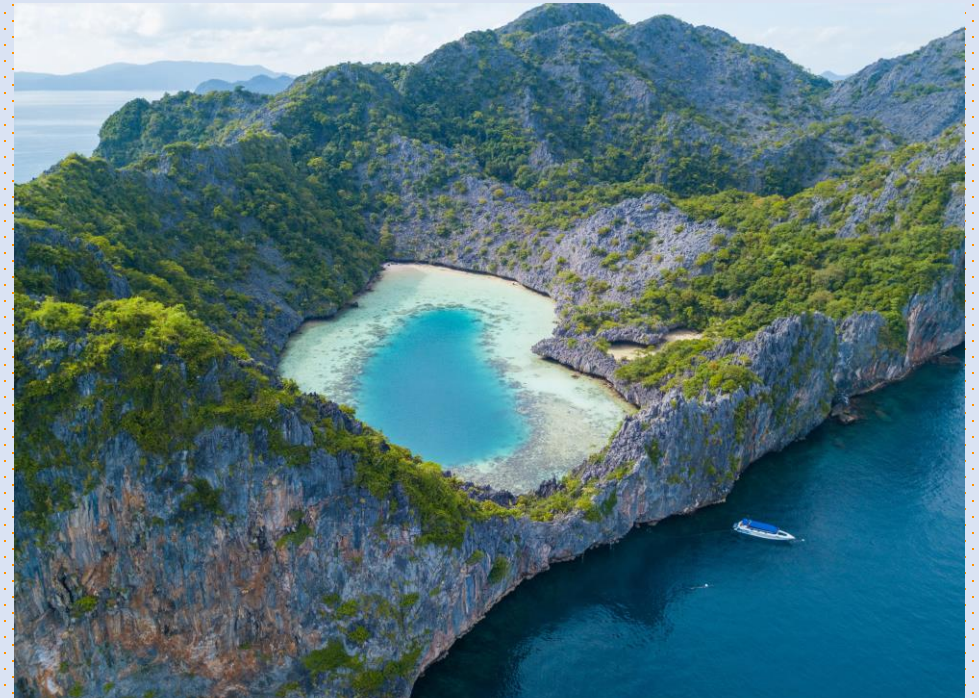
Beaches and Islands in the Myeik Archipelago