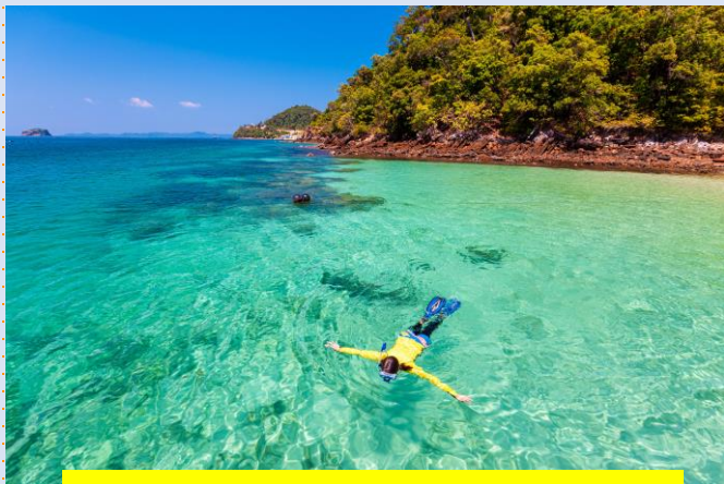
Ngwe Saung Beach