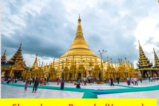
Shwedagon Pagoda (Yangon)