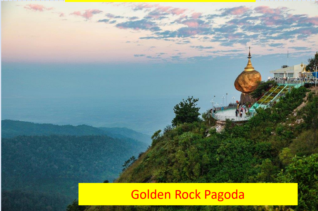
Golden Rock Pagoda