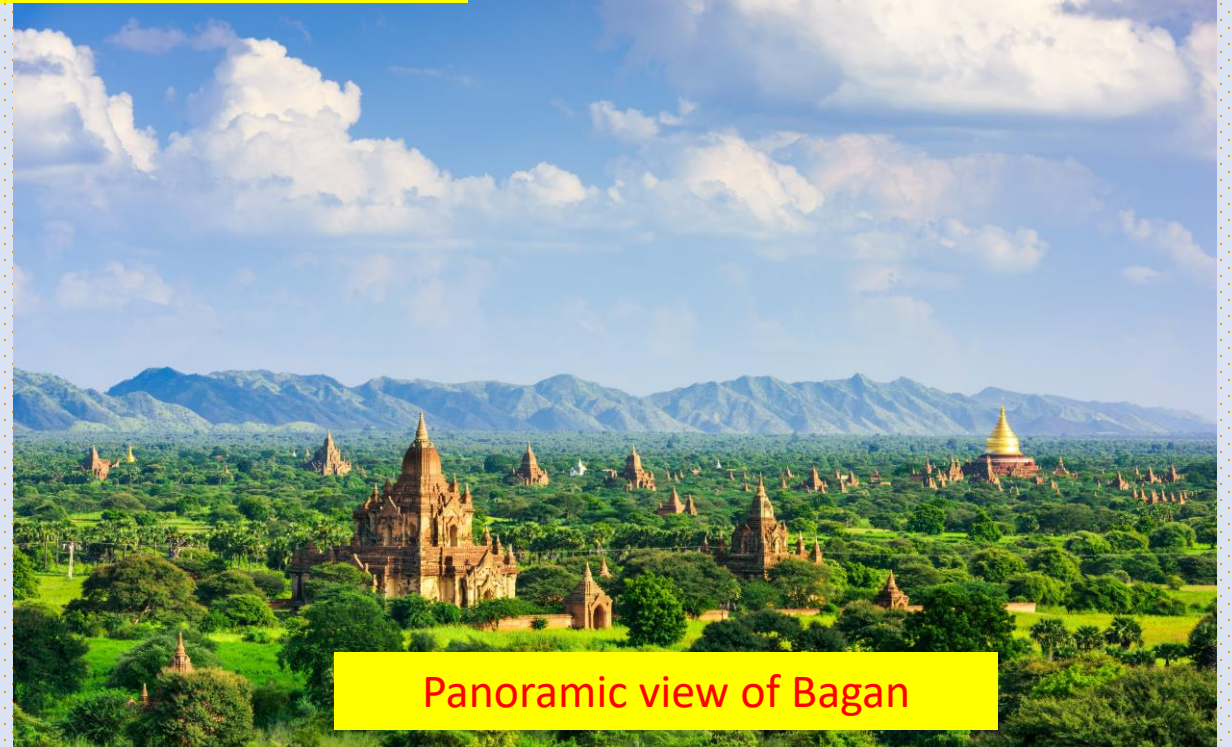
Panoramic view of Bagan