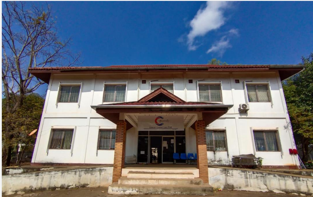
CURRENT CANCER CENTER IN LAOS